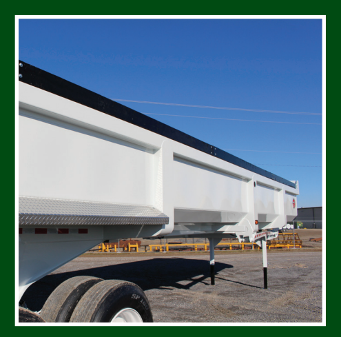
Three-Piece Tub Design Full-length sides and floor provides greater strength.