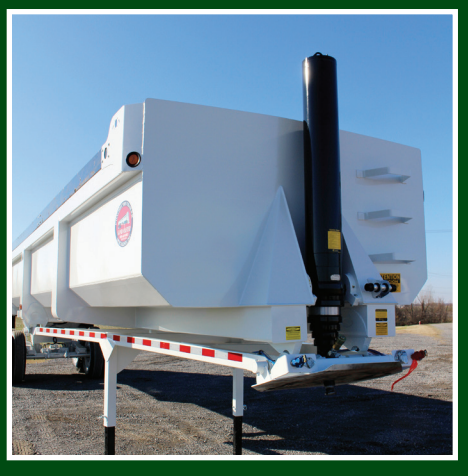
No Doghouse Allows material to flow smoothly with no obstruction.