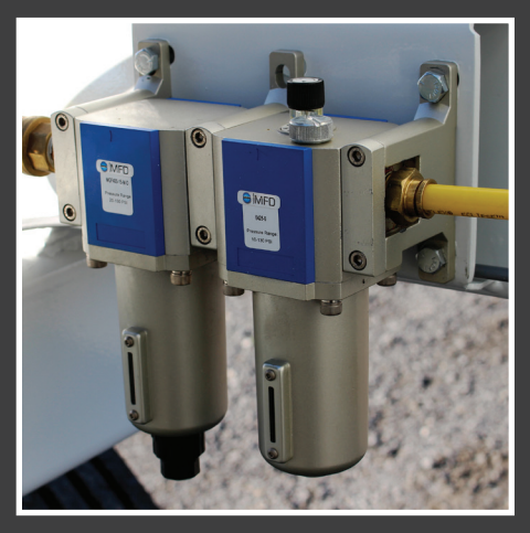
Air & Oil Filter The air filter keeps water out of the lines while the oil filter keeps valves and cylinders lubricated.