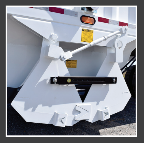
Pitch Control Link/Slide Lock Pin The Pitch Control Link adjustment is used to keep the doors closed. The Slide Lock Pin is designed to lock the doors while traveling, dumping and during repairs.